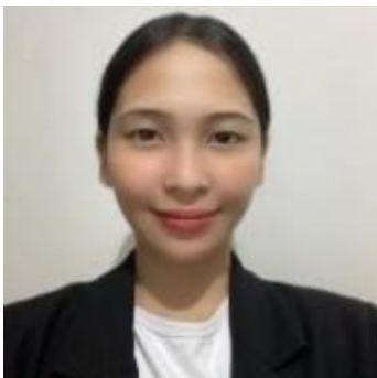
SHALOM NICOLAI SCHOLAR RESEARCH